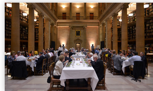
LNA members celebrating the organization's 20th anniversary with dinner at the James Jerome Hill Reference Library in St. Paul, MN.