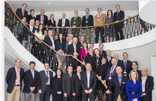
A great group photo of LNA members at the Gibraltar meeting.